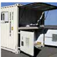
Mobile & Temporary Facilities