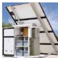
SCADA Monitoring & Control