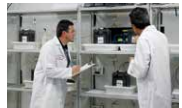
Prototype development and evaluation

battery testing procedures adhere to both BCI and IEC test standards. Trojan's state-of-the-art R&D facilities include charger characterization and analytical labs, battery prototype and evaluation labs and battery autopsy centers all dedicated to providing you with a superior battery that you can rely on.