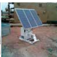
Chemical Injection Pumps