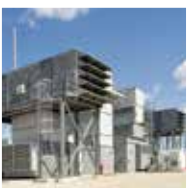
Central Power Stations