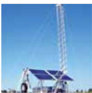
Security & Surveillance